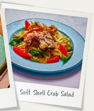
Soft Shell Crab Salad