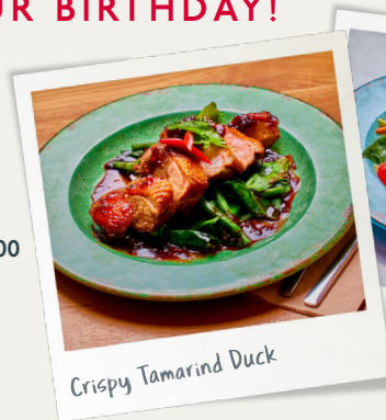
Crispy Tamarind Duck

Thinly sliced duck breast with crispy skin, served on a bed of spring greens and string beans, and topped with our sticky, delicious tamarind sauce. 622kcal